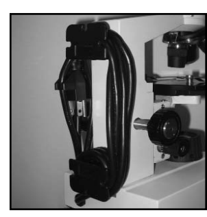
"No hassle" cord storage