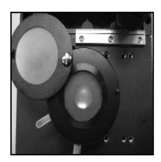
Protective iris diaphragm shield